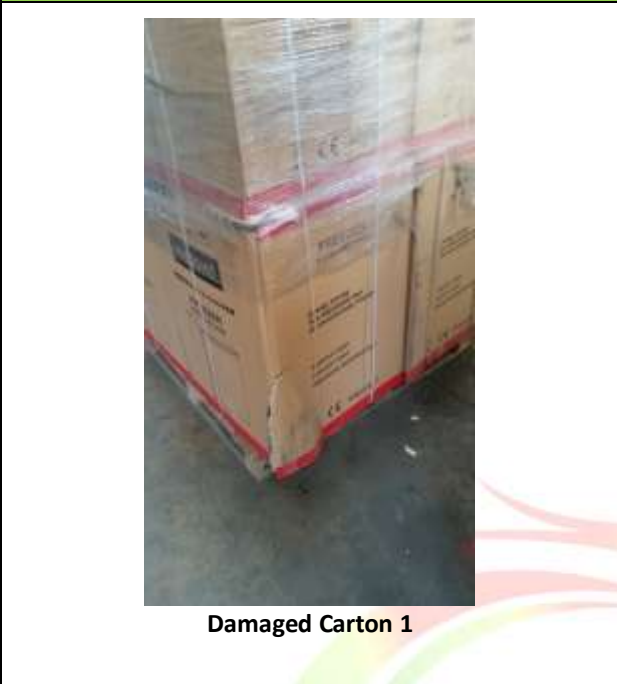
Damaged Carton 1