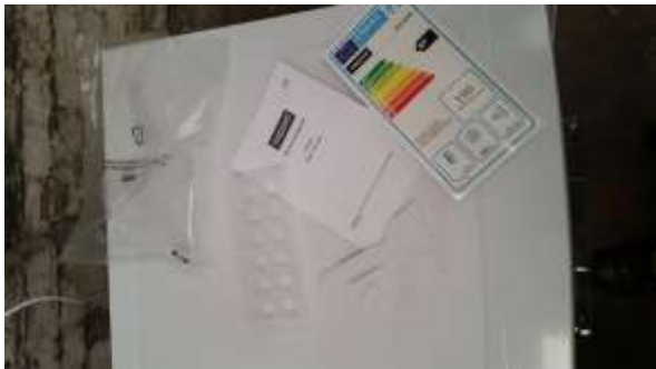
Accessories inside Freezer