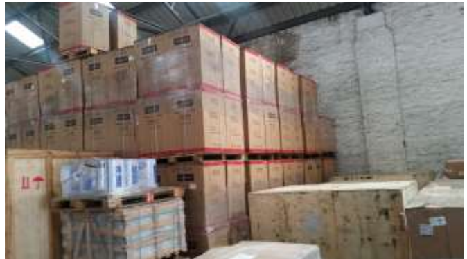
Side view of Freezers stored in Warehouse