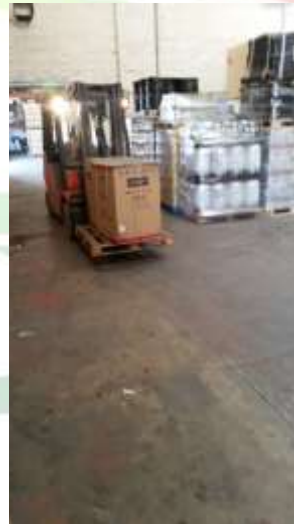
1 pallet only holding two units