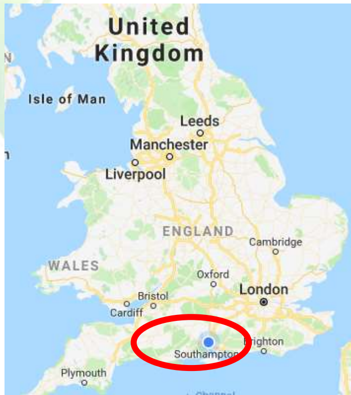
Eastleigh United Kingdom