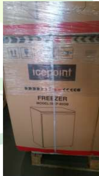
Front of Freezer Box