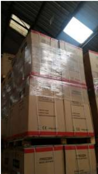
Freezers stored and wrapped on Pallets