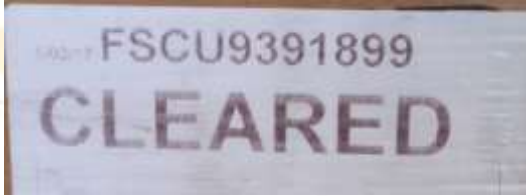
Label showing Date