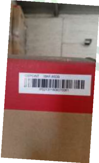
Barcode of Product