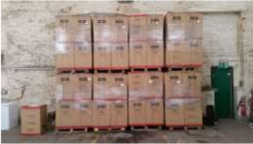
Initial 8 pallets with 8 products per pallet