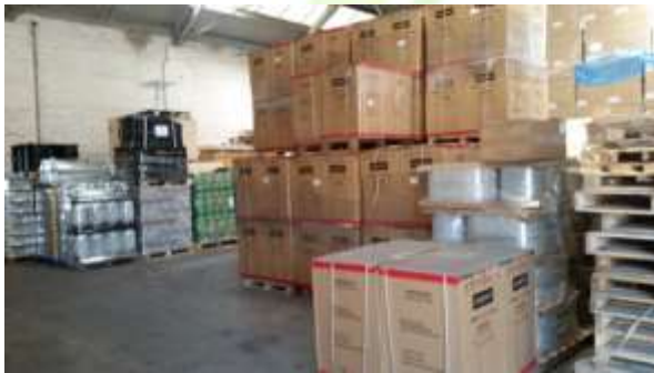
14 pallets (note two pallets only have 4 units per pallet)