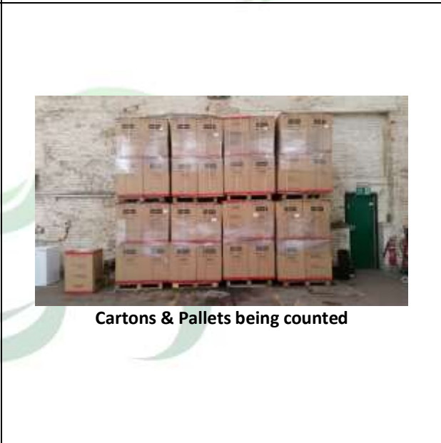
Cartons & Pallets being counted