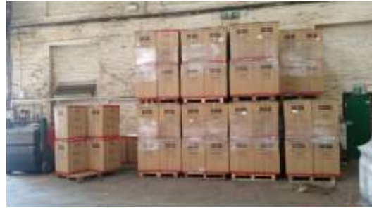
16 pallets (note two units randomly chosen for visual inspection)