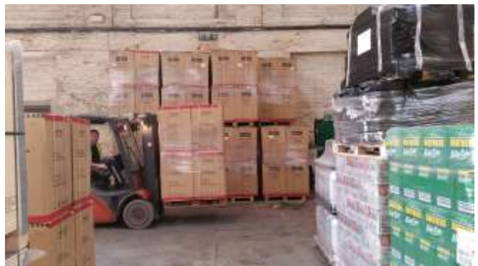
Dan driving Forklift and moving Freezers for count