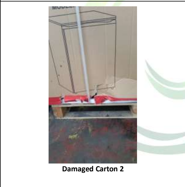
Damaged Carton 2