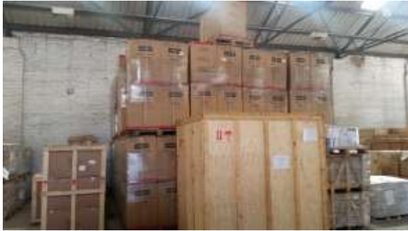
Freezers stored in Warehouse when I arrived